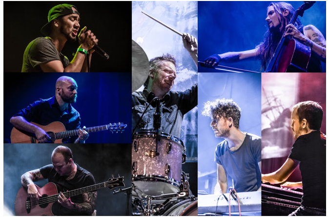
Maiden unitedD